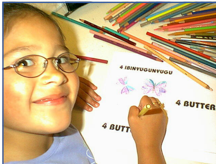
A zoo visitor colors flash cards for students in Rwanda.