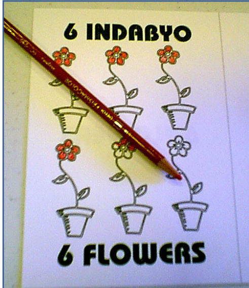
English and Kinyarwanda flashcards facilitate children's ability to read and write.

youth volunteers joined students in Columbus, Ohio, on a special project to help schoolchildren in Rwanda. Initiated by the Columbus Zoo's Partners in Conservation in 2003, Project Knowledge was established in response to a request by Rwandan teachers to help them teach English. The project in-