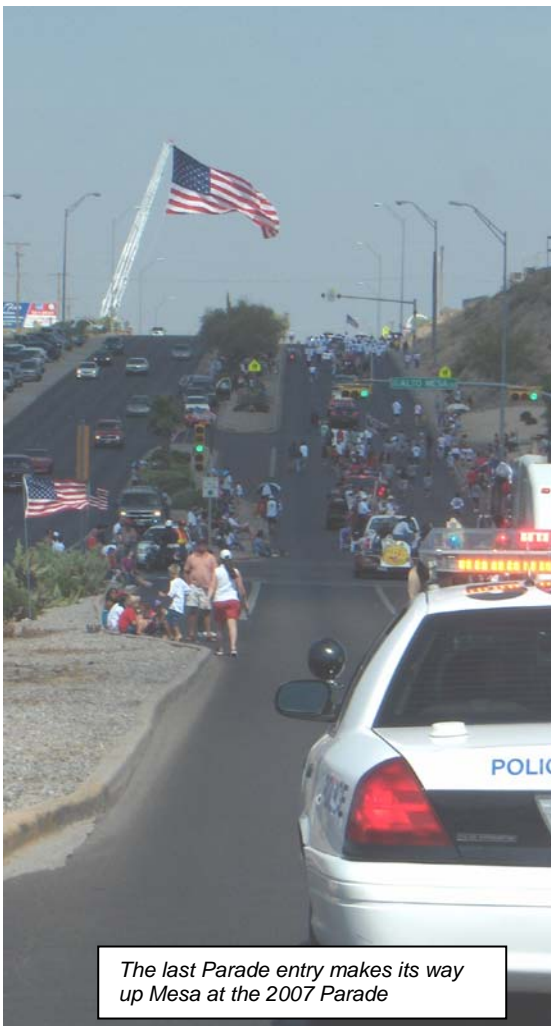
The last Parade entry makes its way up Mesa at the 2007 Parade

Our 4 th of July Parade Committee met on Friday, March 14 th at 7:00 AM at JB's Café on Mesa. The Committee decided to modify the Parade Theme to "Rotary Shares" in El Paso's Future So Let's Make Our Dreams Real.