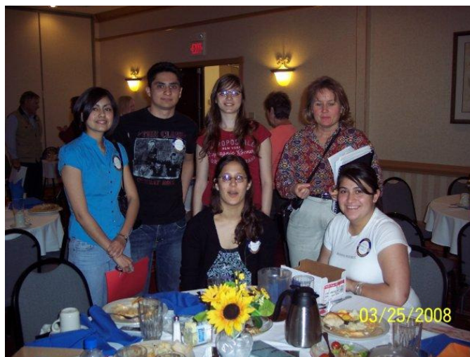
UTEP Rotaract Club Visits RCWEP Club Meeting - March 2008 Special Thanks to Gail Gale for inviting them.